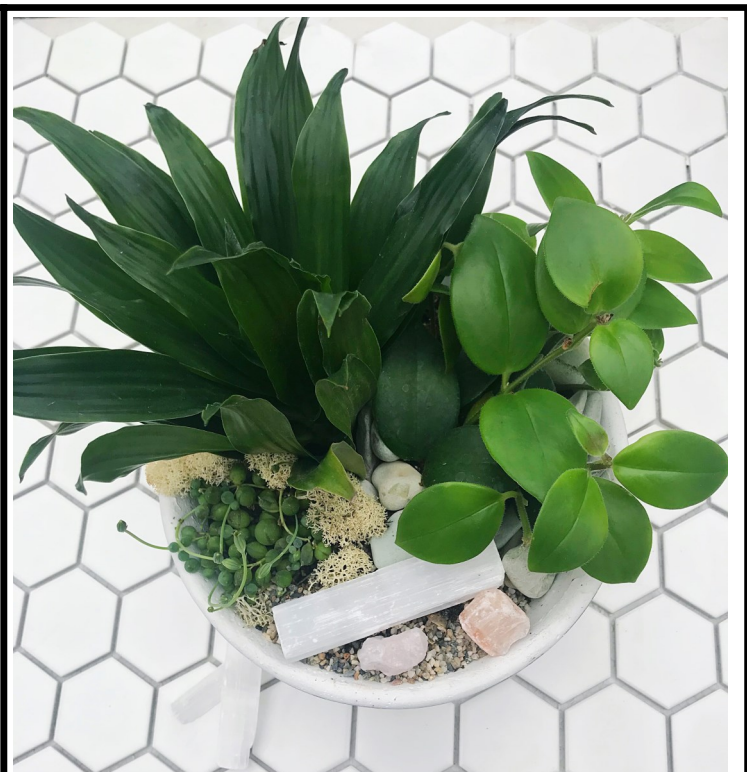
Tropical Planter January 25th