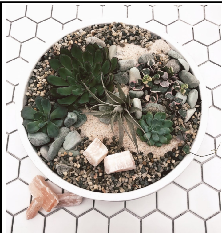
Succulent Planter Galentine's day February 8th