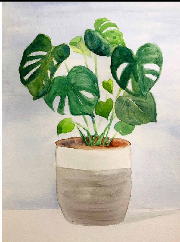
Monstera Watercolor January 18th